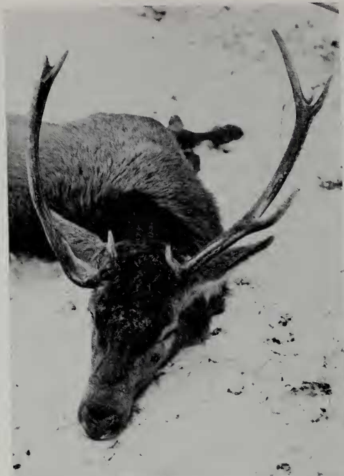
Fig. 12. Red deer stag Fernando. Picture taken on December 9th, 1966

region. Such accidents may happen in red deer in the forest and produce unnormal antlers. These anomalies cannot be hereditary and need not be designated for selective shooting.